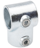
A2 SHORT TEE