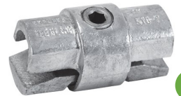
A9 INTERNAL JOINER