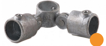
A48 CORNER SWIVEL